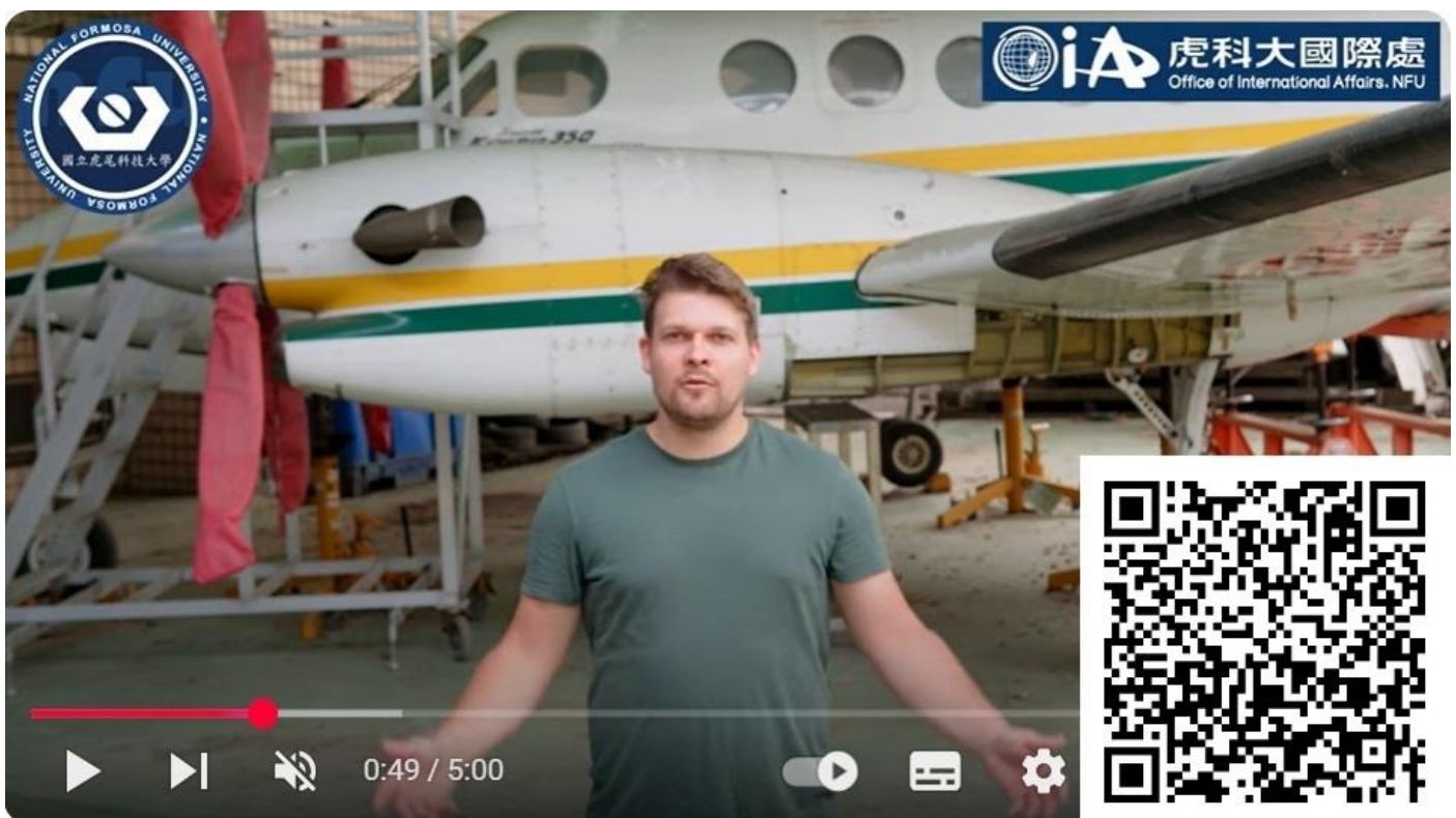
▲ Students from Czech technical university in Prague