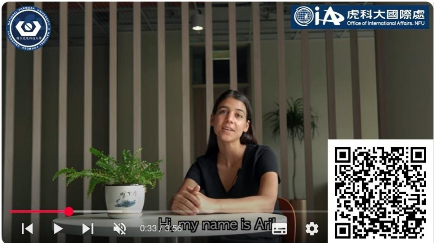
▲ Student from Budapest Business University (Budapest University of Economics and Business)

Please scan the QR Codes to see the reflection videos of pervious European students participating in Formosa Talent Internship Program (Formosa TIP)